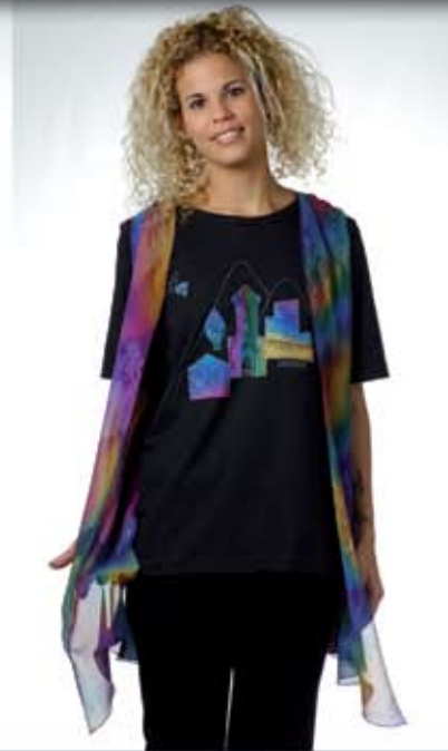
Top 1003, shirt 5015 colour 460