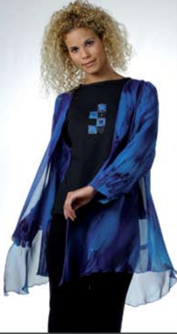
Top long sleeves 1607, shirt 5301, colour 463