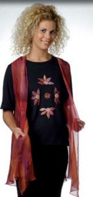
top 1003, shirt 5267 colour 553