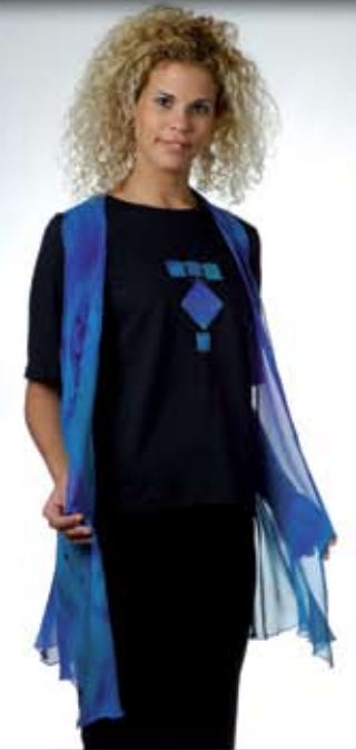
top 1003, shirt 5302 colour 461