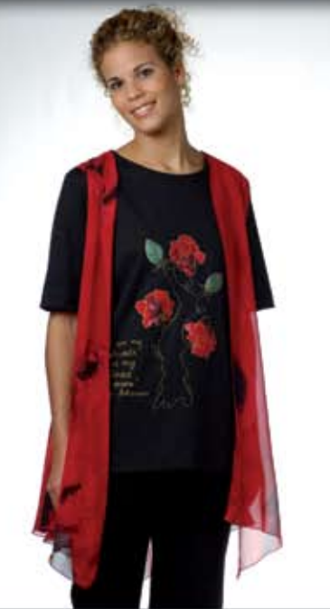
Top 1003, shirt 5003 colour 457