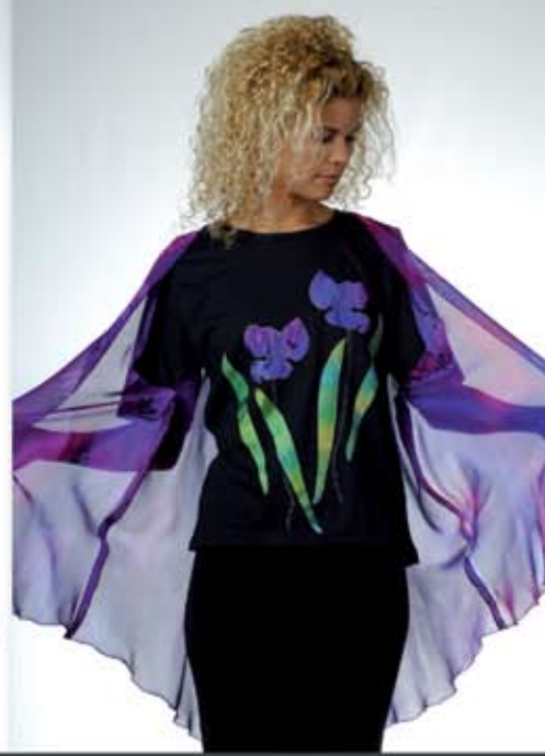
Top 1003, shirt 5025 colour 452