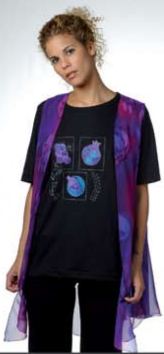
Top 1003, shirt 5010 colour 452