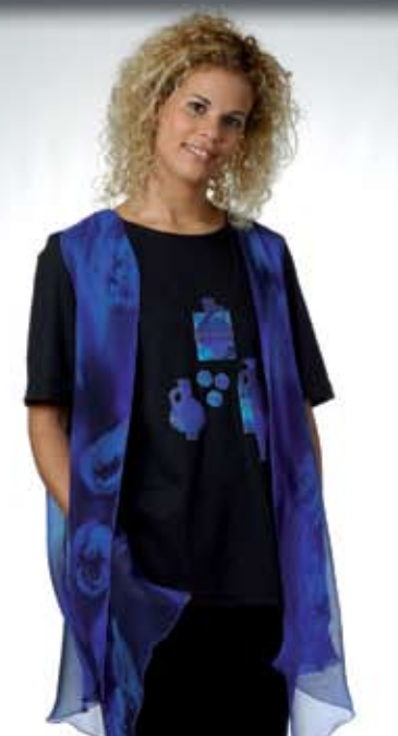
Top 1003, shirt 5017 colour 480