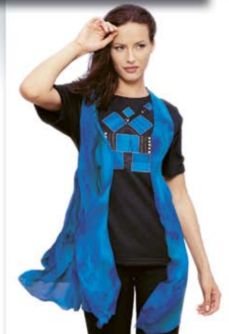
Top 1003, shirt 5016 colour 461